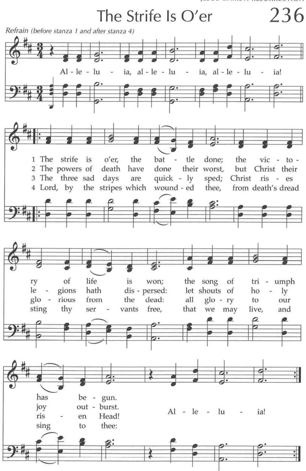
The Latin text from which this hymn has been translated may well be older than its earliest printing in a 17th-century collection published in Cologne. It is set to an adaptation of a portion of the Gloria Patri section from a 16th-century choral version of the Magnificat.