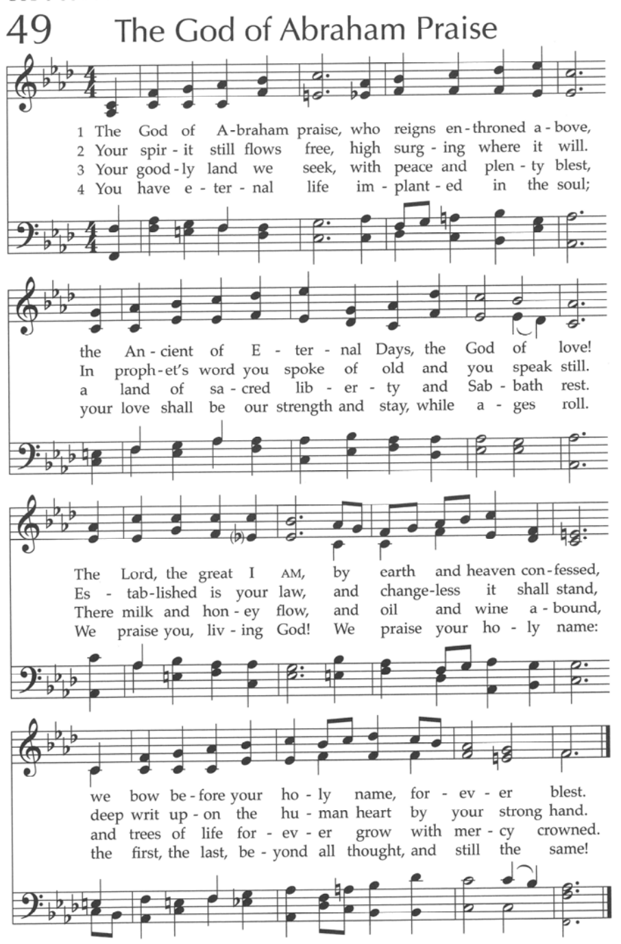
Shaped by its traditional Jewish tune, this selection of English stanzas conveys the essence of the Yigdal , a canticle based on a medieval Hebrew statement of faith about the nature of God and often used in synagogue worship, alternately chanted by cantor and congregation.